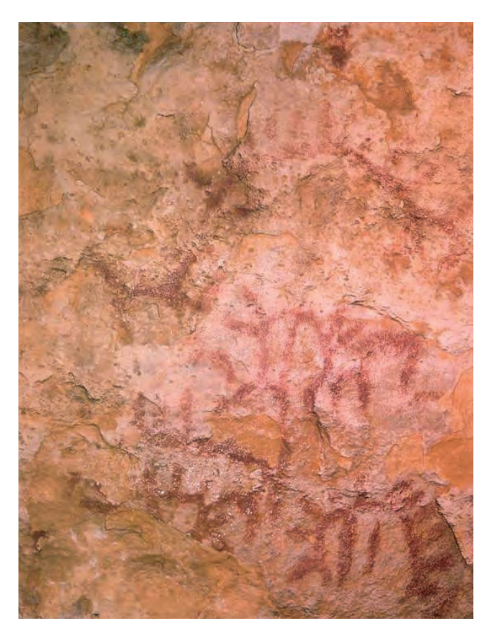
Figure 1. El Portell de les Lletres (Montblanc, Tarragona).

set of rock paintings currently known as El Portell de les Lletres (Montblanc, Tarragona).