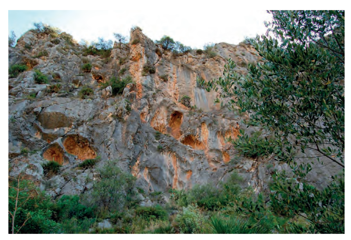
Figure 4. Shelters in Pla de Petracos (Castell de Castells, Alicante).

rations in Or, La Sarsa and La Falguera, where the X and double Y anthropomorphs are also associated with schematic art.<sup>26</sup>