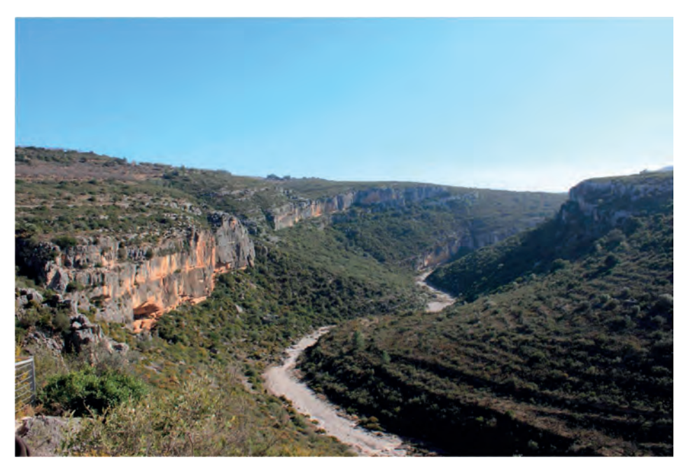
Figure 5. Barranc de la Valltorta. Visibility from Mas d'en Josep (Tírig); in the background, the La Saltadora shelters (Coves de Vinromà, Castellón de la Plana).

(Obón, Teruel) has also been identified in other shelters in Teruel, Alicante, Murcia and Albacete. With regard to other motifs, we could cite the scenes of clashing humans, male and female representations, a woman next to a man's corpse in Abric Centelles, the discovery of a new tree in La Sarga and the spatial distribution of certain animals, such as boars and bovids, which must be a continuation of other animal depictions. In a similar vein, restudying the human figure as I. Domingo Sanz did or some of the objects like arrowheads is also of vast interest. The most unique contributions are unquestionably related to the composition and internal structure of the scenes, and one example worth pursuing further is the studies performed in Cova dels Cavalls (Tírig, Castellón de la Plana), which stands out at the Valltorta site.