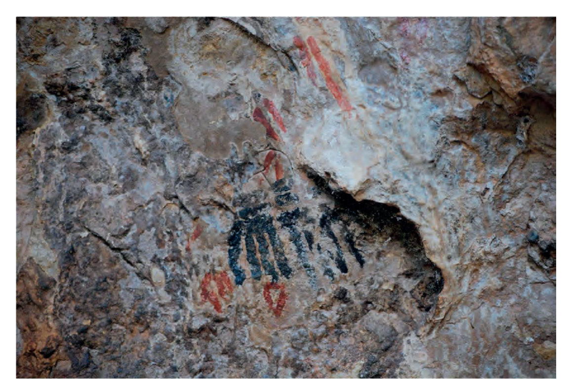
Figure 6. Schematic art. Barranc de Carbonera (Beniatjar, Valencia).

In fact, through their association with other motifs, some of these motifs date from later, which would also corroborate the portable record from the late Neolithic and Eneolithic.