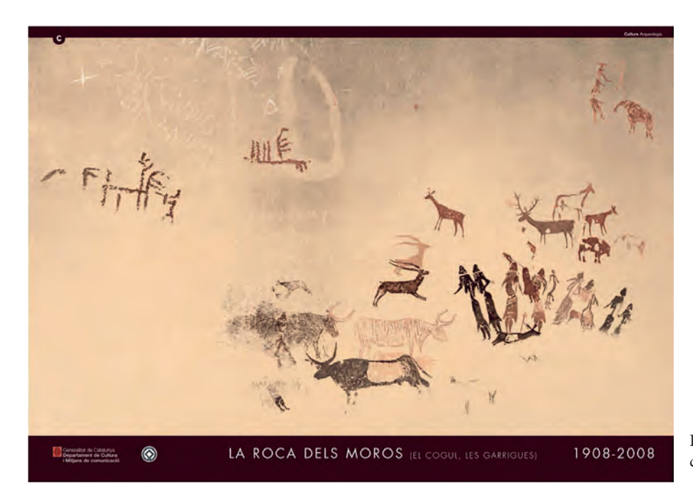
Figure 8. Poster of El Cogul published to celebrate the centennial of its discovery.

Perelló) as part of the Corpus of Rock Paintings of Catalonia project, the only one of its kind on the Iberian Peninsula, Catalonia embarked upon a pathway which all the other autonomous communities have followed, albeit to uneven success.<sup>45</sup>