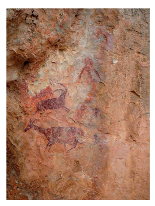
Figure 7. Painted panel in Cabra Feixet before and after the cleaning intervention.

the fingers can be clearly identified, as well as the entire string of the bow he is holding.